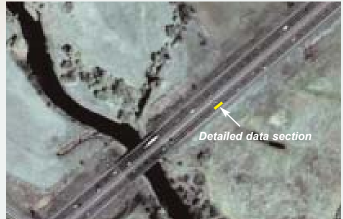
Figure 1: Google Earth map showing the location of detailed GPR data presented in Figure 2.

Slight deformation of the asphalt structure above the joints suggest upward migration of the deformation. These characteristics are clear indicators of slab movement at the joints.